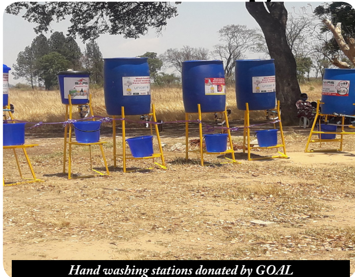
Hand washing stations donated by GOAL