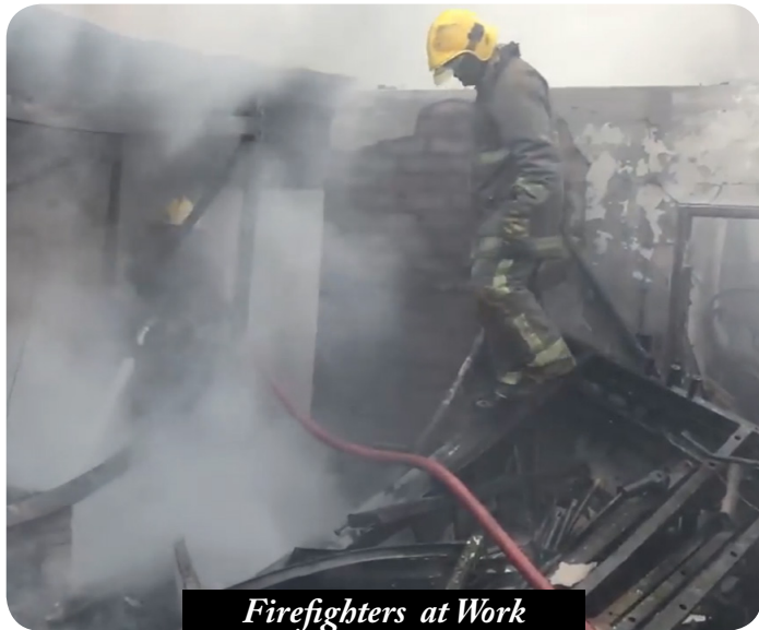
Firefighters at Work