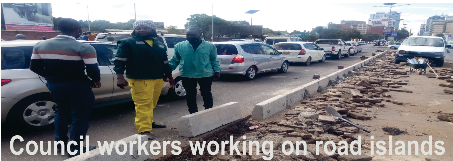
Council workers working on road islands