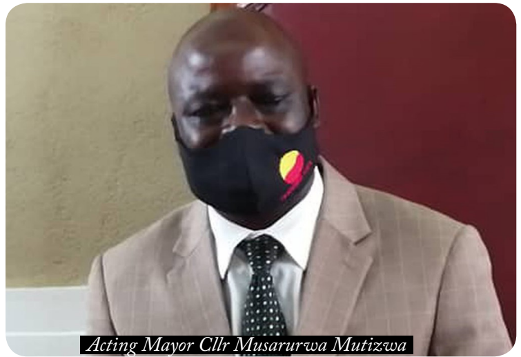
Acting Mayor Cllr Musarurwa Mutizwa

“Our choice is Pomona (for incineration) using the existing dumpsite. We are going to invite partners and Government is helping in creating